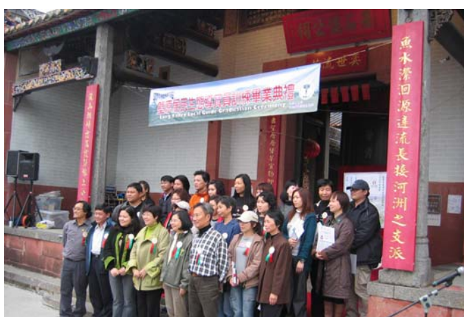
Fig. 2. The graduation ceremony of the Long Valley local guide training by the Conservancy Association was held in February 2006 at the Ancestral Hall of Ho Sheung Heung. All 20 guides trained came from the local communities. This shows that local communities in the New Territories do support conservation initiatives.

For PPP, developments at appropriate scales may be allowed in the least sensitive parts of the 12 sites, or their surroundings, provided that the developers undertake long-term management of the rest of the sites for nature conservation. All PPP projects should generate net benefits to nature conservation, and land exchange under PPP will be considered by the government. At least 6 PPP projects, all on different sites, were submitted to the government in May 2005. To date, none of these projects has been approved. A recent news article on a local newspaper, Ming Pao, pointed out that the delay in the decision on these PPP projects was primarily due to worries amongst lands-related departments and the bureau. It was said that they did not want to set a precedent for land exchange, or plot ratio increment/transfer, for conservation causes. This is because, unlike many overseas administrations such as the UK, conservation is not considered a "public purpose" in the bureaucratic system in Hong Kong.