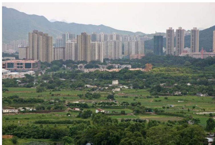
Fig. 1. Important ecological sites on private lands in Hong Kong are usually small and fragmented, such as Long Valley in the foreground of this picture. Active management is needed to maintain their ecological values and a conservation trust is believed to be beneficial for such purpose.

Under the pilot Management Agreement scheme, NGOs can apply for funding from the Environment and Conservation Fund (HK$ 5 million have been set aside for this scheme) to engage land owners of these 12 sites to manage the lands for nature conservation. Two projects at Long Valley and one at Fung Yuen were approved in December 2005 amounting to over 4.5 million dollars. Whilst the benefit of these habitat management work to biodiversity are yet to be assessed, local landowners and farmers are willing to participate in these projects by renting lands and premises to the NGOs, or work for the NGOs to manage the lands. These have shown that local communities are more open-minded to conservation than previous perceptions. However, funding for all 3 projects will finish by the end of 2007. There is no indication as to what will happen after these 3 pilot projects are completed.