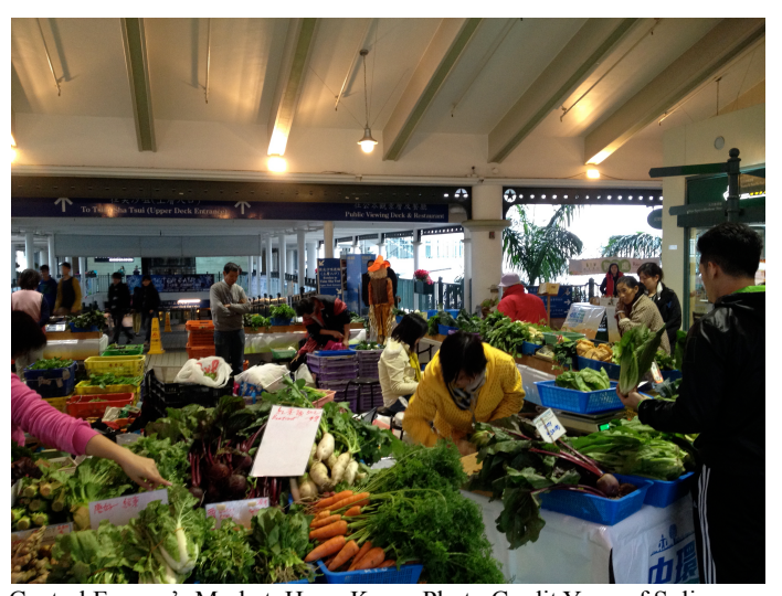
Central Farmer's Market, Hong Kong.

In recent decades, an aging population, changing agricultural practices, globalization of our food supply, among other factors, have created new and emerging food safety threats while traditional concerns persist. As a result, issues in food safety impact the well-being of humans and, importantly, the global economy. The conference will address the emerging issues and the diverse aspects of food safety with special emphasis on global impact.