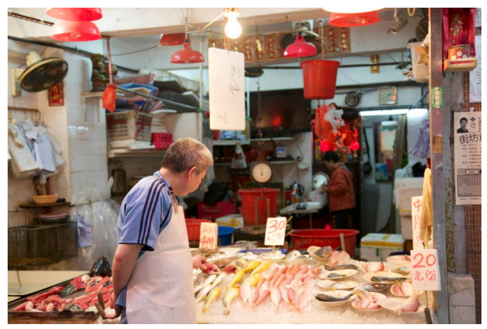
Wet Market, Hong Kong.

This panel of experts will update the attendees on recent developments and up-to date information on Food Safety Regulations. This panel will offer attendees an opportunity to ask questions on legal issues related to food safety regulations.